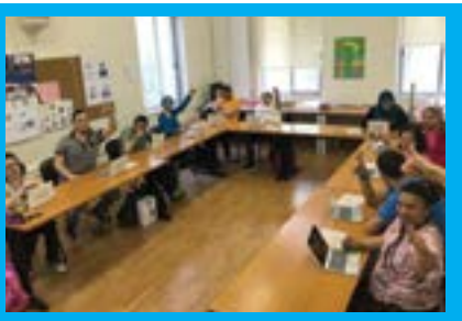
Next Step AUB students - Smart